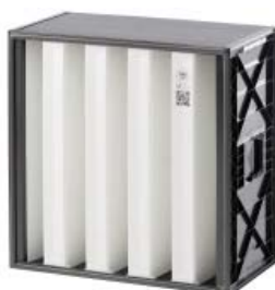
3. Absolute ProSafe H13