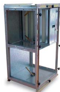
4. FCBL Class C