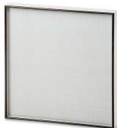
6. Megalam ME