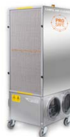
9. CC 6000 ProSafe