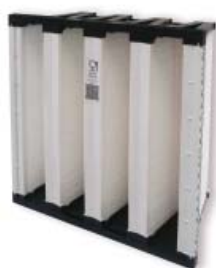
2. Opakfil ProSafe F8