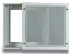
7. Sofdistri Reprise